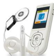
THE NUCLEUS 5 SYSTEM

In January Cochlear announced its latest hearing implant system the Nucleus 5. It consists of the next generation implant and next generation external processor. The Nucleus 5 is the world's thinnest cochlear implant and is 40 per cent thinner and two-and-a-half times stronger than the previous device. The Nucleus 5 processor has an Automatic Telecoil.